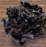
味キク Flavoured black fungus (Thick)