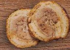
炙り チャーシュー Aburi pork belly chashu