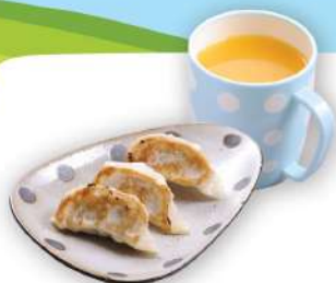
PAN FRIED GYOZA (3 PCS)