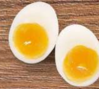
半熟うまみ玉子 Salted soft-boiled egg