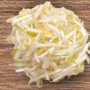
もやし Bean sprouts