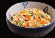
IPPUDO Fried Rice

ALL IMAGES ARE FOR ILLUSTRATION PURPOSES ONLY. ALL PRICES SHOWN ARE SUBJECT TO 10% SERVICE CHARGE AND 6% SST.