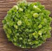
ねぎ Spring onions