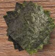
のり Seaweed (5pcs)