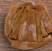
メンマ Bamboo shoots