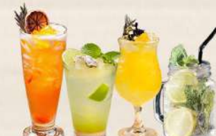
The Salvation • Nature Nectar • Summer Breeze • Lemon Mint Soda +RM 9.90 per glass