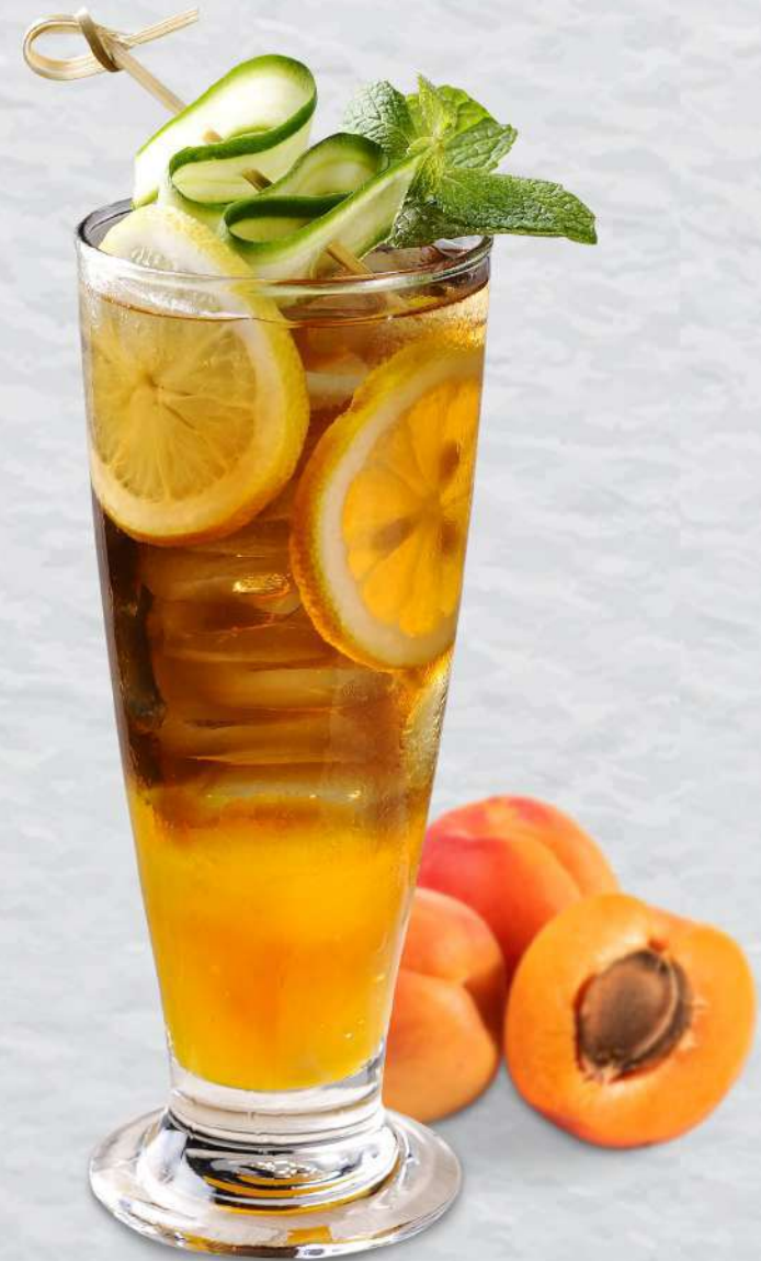
PEACH PASSION FRUIT TEA