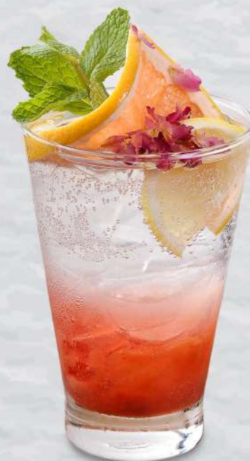
PINK GUAVA ROSE SODA