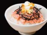
Sake Mentai Rice