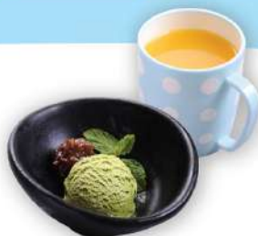
GOMA / MATCHA ICE CREAM