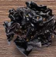
味キク Flavoured black fungus (Thick)