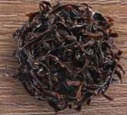
味キク Flavoured black fungus (Thin)