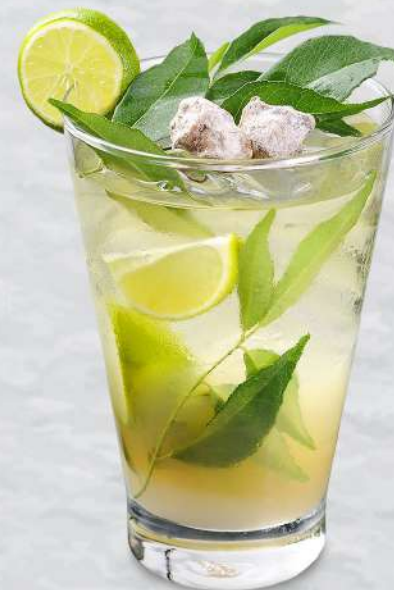
TROPICAL SPICE PUNCH