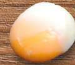
温泉卵 Poached egg