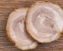
豚バラ チャーシュー Simmered pork belly chashu