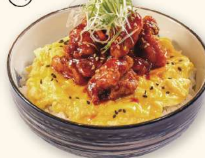
Spicy Tori Omu Donburi RM23

All Set Meals include Miso Soup & Fruits