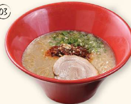
Egao Karaka-men RM26

All Set Meals include Fruits & Japanese Pickled Mustard