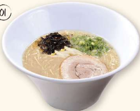
Egao Shiromaru Motoaji RM24