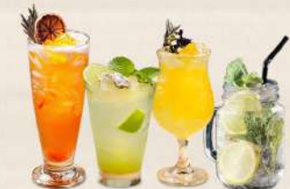
The Salvation • Nature Nectar • Summer Breeze • Lemon Mint Soda +RM 9.90 per glass