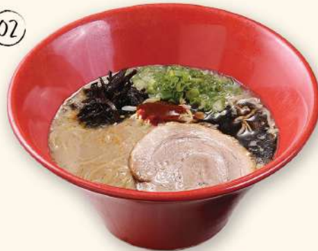
Egao Akamaru Shinaji RM25