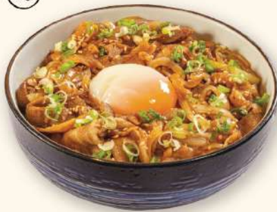
Porky Onsen Delight Donburi RM22