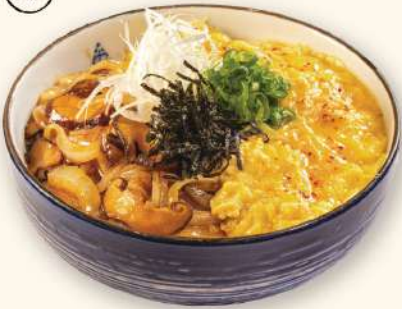
Omu Zen Donburi (Plant-Based) RM17