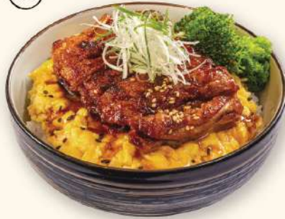
Teriyaki Tori Donburi RM22