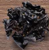
味キク Flavoured black fungus (Thick)