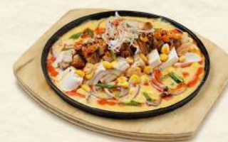
Set A Sanshio Tofu Teppan