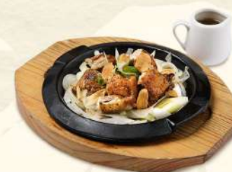
Set B Wasabi Yuzu Chicken Teppan